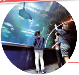
Sea of Japan Main Tank Exhibits of fish that inhabit the Sea of Japan from the shallows to the depths. Enter the Marine Tunnel to feel like you are under the sea.