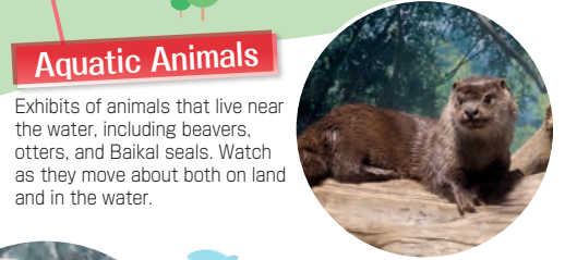
Aquatic Animals Exhibits of animals that live near the water, including beavers, otters, and Baikal seals. Watch as they move about both on land and in the water.