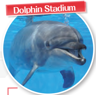
Dolphin Stadium Featuring shows that let you see how dynamic dolphins are. If you're lucky, you may get chosen to see the dolphins up close!