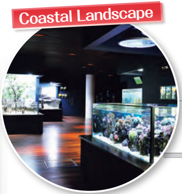
Coastal Landscape A recreation of seven coastal environments including coral reefs and tidal flats, and an exhibition of the animals in those habitats.