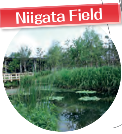
Niigata Field A recreation of Niigata's natural waterfront environments with a rice paddy, dune lake and other features.