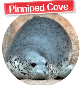
Pinniped Cove You can watch Steller sea lions, California sea lions, and spotted seals swimming around, either from above or through the glass of the tank below. We'll also provide facts during feeding time.